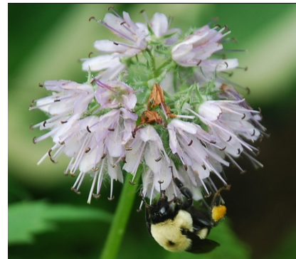
Queen Bumblebee on Hydrophyllum virginianum (Virginia Waterleaf)