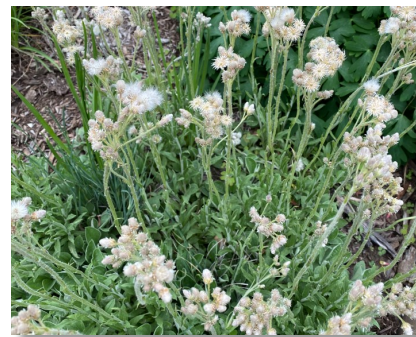
Antennaria plantaginifolia (Pussytoes)

Native garden design ideas. nativegardendesigns.wildones.org/