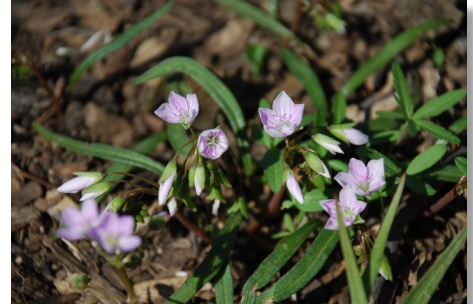
Claytonia virginica (Spring Beauty)

We make every effort to ensure the plants that you receive are healthy at the time of pickup. Wild Ones Rock River Valley Chapter cannot guarantee plant materials after they leave our possession. New plants, especially plugs, should be planted and watered soon after purchase. Some plants may need extra care, as well as protection from wildlife, until they have become established.