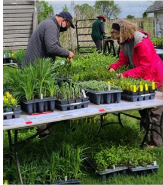
Volunteers at the plant sale