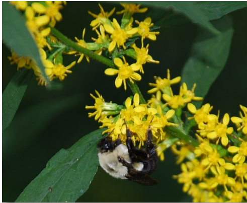
Bumblebee on Solidago ulmifolia (Elm-leaved Goldenrod)