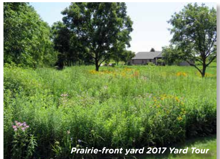
Prairie-front yard 2017 Yard Tour