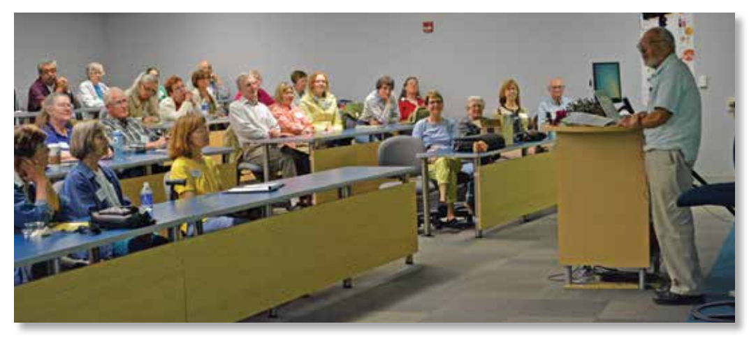
The audience at the May 19 Meeting

The program is free and open to the public. For additional information, call (815) 332-3343