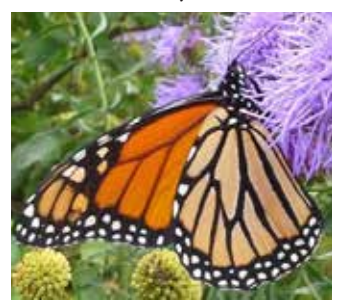
Newly released butterfly

had they been left in the wild on their own. Nice job, everyone. Let's strive to release twice as many monarch butterflies next year!