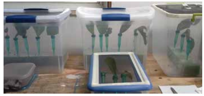
Giesen transition cages

We were proud to show our broods to neighbors and friends and never tired of the endless questions about the monarch life cycle - sometimes I even dreamed about them. Last year I raised 17 toward the end of the season after I found a plump caterpillar nearing its time to morph into a chrysalis. This year I planned to raise monarch butterflies, but didn't get started until July 18. Nevertheless, I released the last male, number 72, on September 16. I kept a phenological record of the entire process, from the weather and egg count to which milkweed plants yielded the most eggs, to the wandering caterpillar looking for that perfect location to stop, rest, spin its silk button, and then fall into its "J" form, to the fascinating metamorphosis of a beautifully striped caterpillar into an entirely new being, a shiny jade green chrysalis with golden specks! Some of us were fortunate