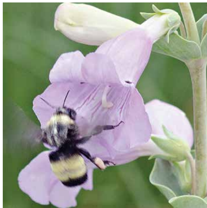
Bombusauricomus on Penstemon

For more of Molly Fifield-Murray's photos visit: