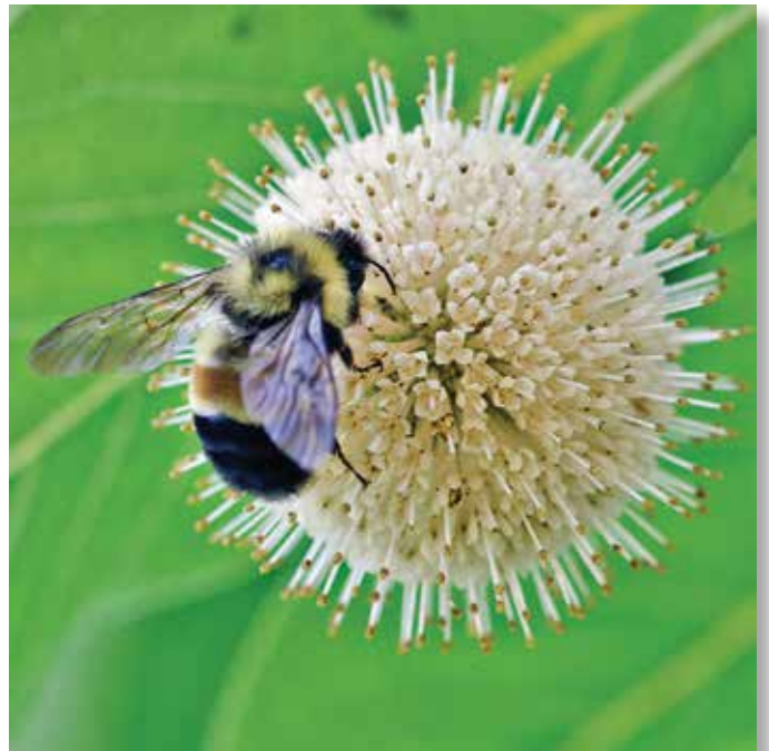
Bombus Affinis on Buttonbush