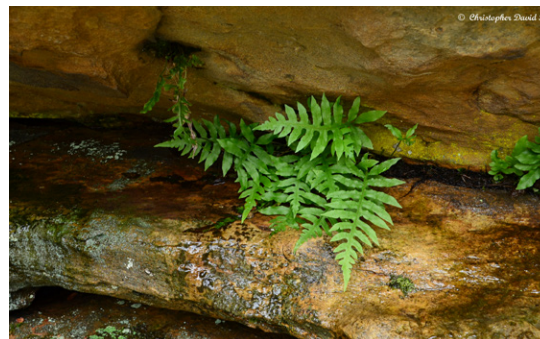
Nettle Chain Fern ( Woodwardia aerolata ).

Over 100 native fern species can be found in Illinois. This Zoom presentation will introduce basic fern terminology with photos and identification tips to identify them in the wild.