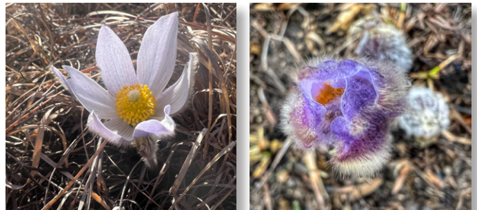
Pasque flower

You can purchase pasque flower plants from our Native Plant Sale. Order forms are now online at www.wildonesrrvc.org .