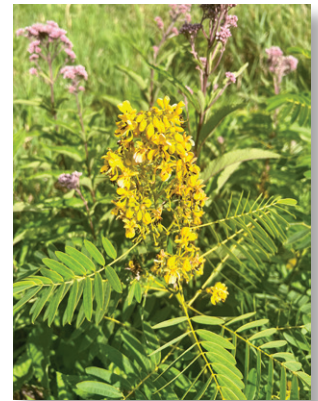
Wild senna

Prairie Blazing Star ( Liatris pycnostachya ) Prairie Coreopsis ( Coreopsis palmata ) Prairie sunflower ( Helianthus pauciflorus ) Purple Prairie Clover ( Dalea purpurea ) Queen of the Prairie ( Filipendula rubra ) Rosinweed ( Siophium integrifolium ) Round-headed Bush Clover ( Lespedeza capitata ) Royal Catchfly ( Silene regia ) Showy Tick Trefoil ( Desmodium canadense ) Slender Mountain Mint ( Pycnanthemum tenuifolium ) Spikenard ( Aralia racemose ) Spotted Horsemint ( Monarda punctata ) Swamp Milkweed ( Asclepias incarnata ) Tall Boneset ( Eupatorium altissimum ) Tall Cinquefoil ( Potentilla arguta ) Turtlehead ( Chelone glabra ) Western Yarrow ( Achillea millefolium ) White Prairie Clover ( Dalea candida ) White Wild Indigo ( Baptisia alba ) Whorled Milkweed ( Asclepias verticallata ) Wild Bergamot ( Monarda fistulosa ) Wild Quinine ( Parthenium intergrifolium ) Wild Senna ( Senna )